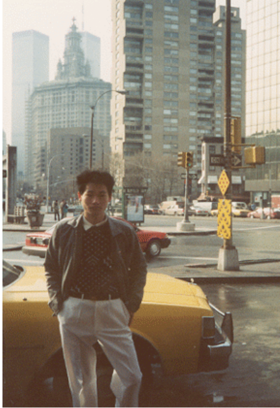
New York City. I spoke no English when I came to America.