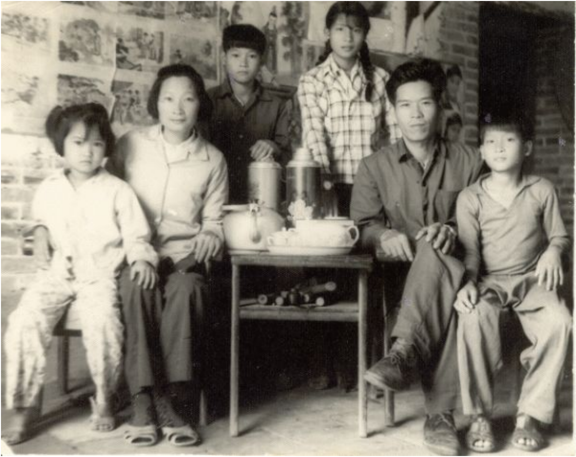
My first family picture taken in 1983. I'm the boy standing in the back.